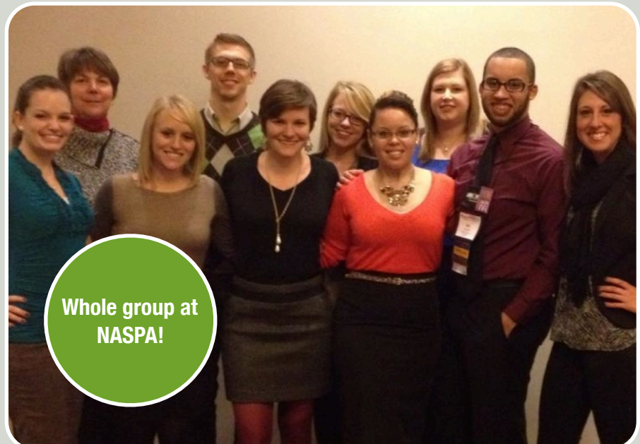
Whole group at NASPA!