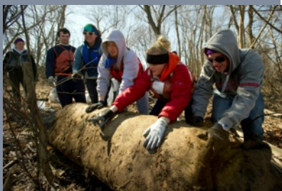
Alternative Spring Break Undergrads hard at work!